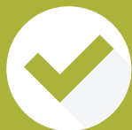
FIGURE 01 The Prepared People